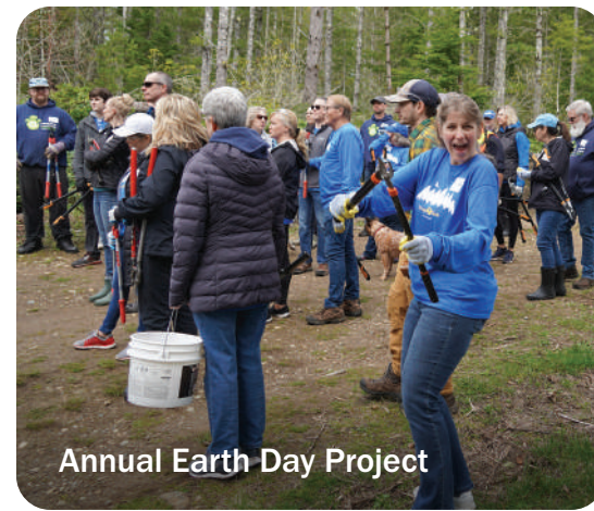
Annual Earth Day Project