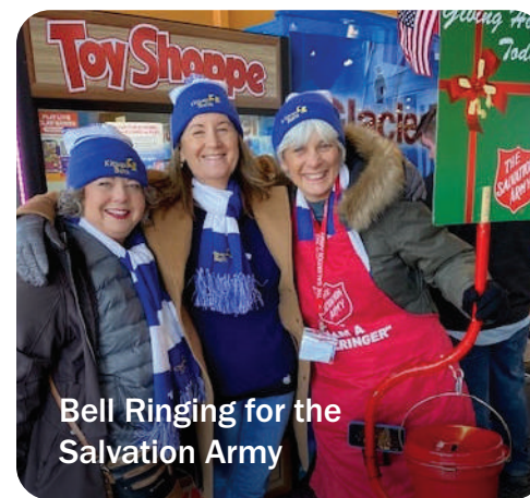
Bell Ringing for the Salvation Army