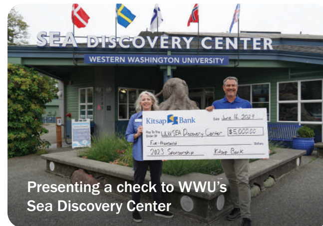
Presenting a check to WWU's Sea Discovery Center