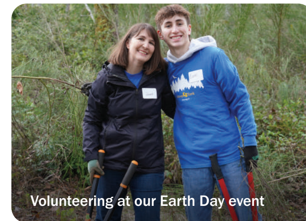
Volunteering at our Earth Day event