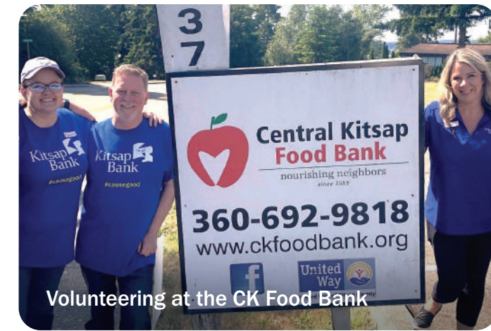
Volunteering at the CK Food Bank