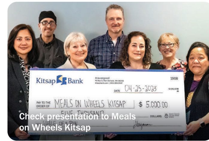
Check presentation to Meals on Wheels Kitsap