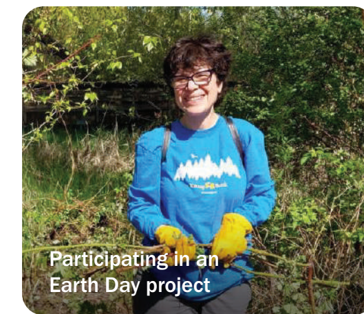
Participating in an Earth Day project