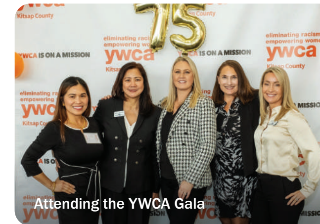
Attending the YWCA Gala